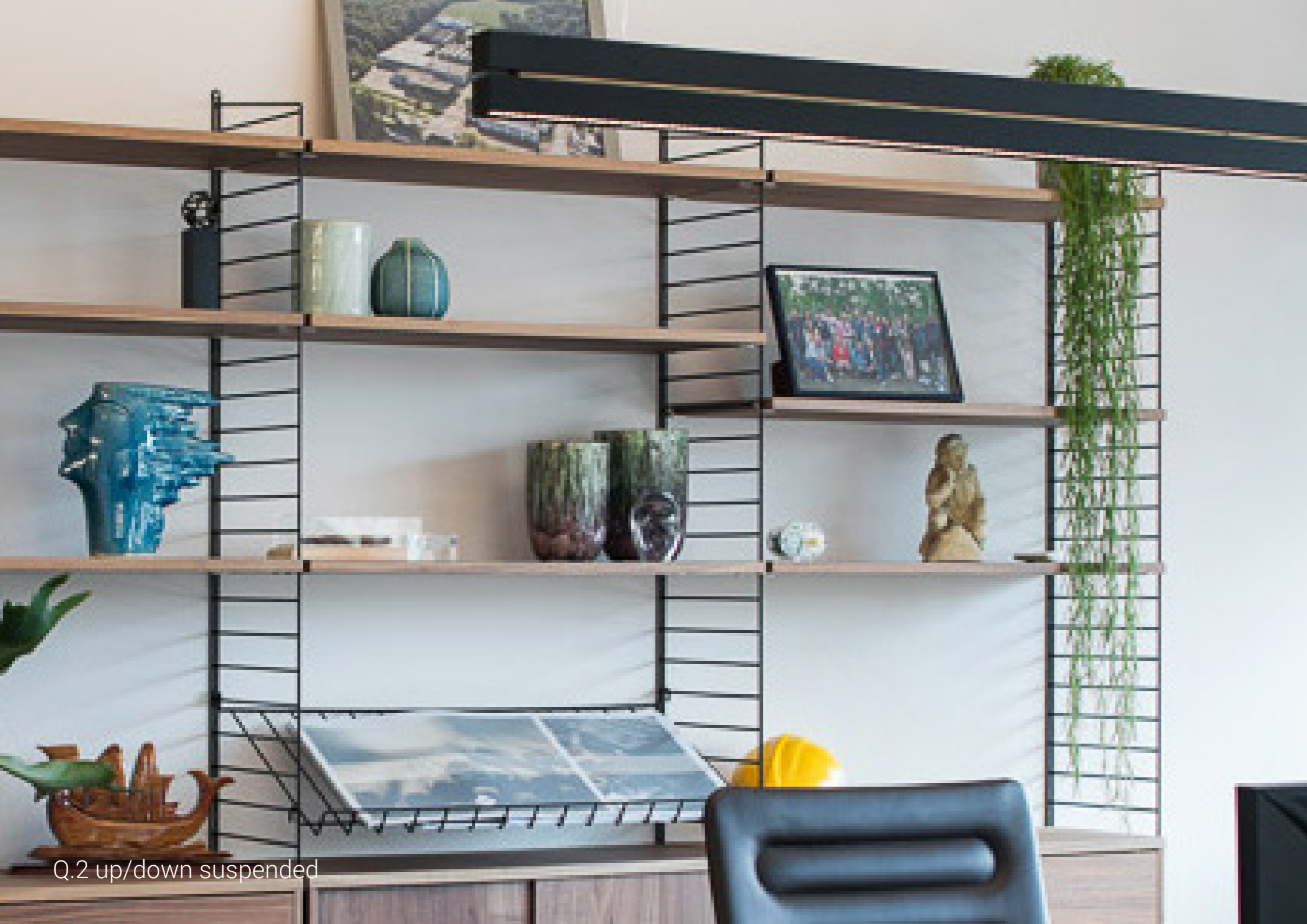
Q.2 up/down suspended